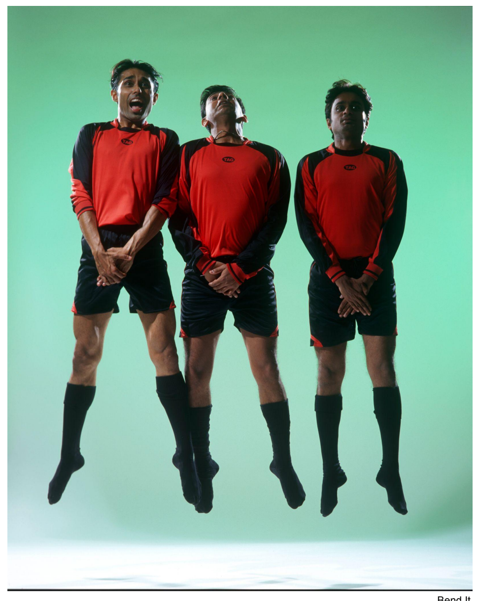
Three Srishti classics touring in Spring and Autumn 2025