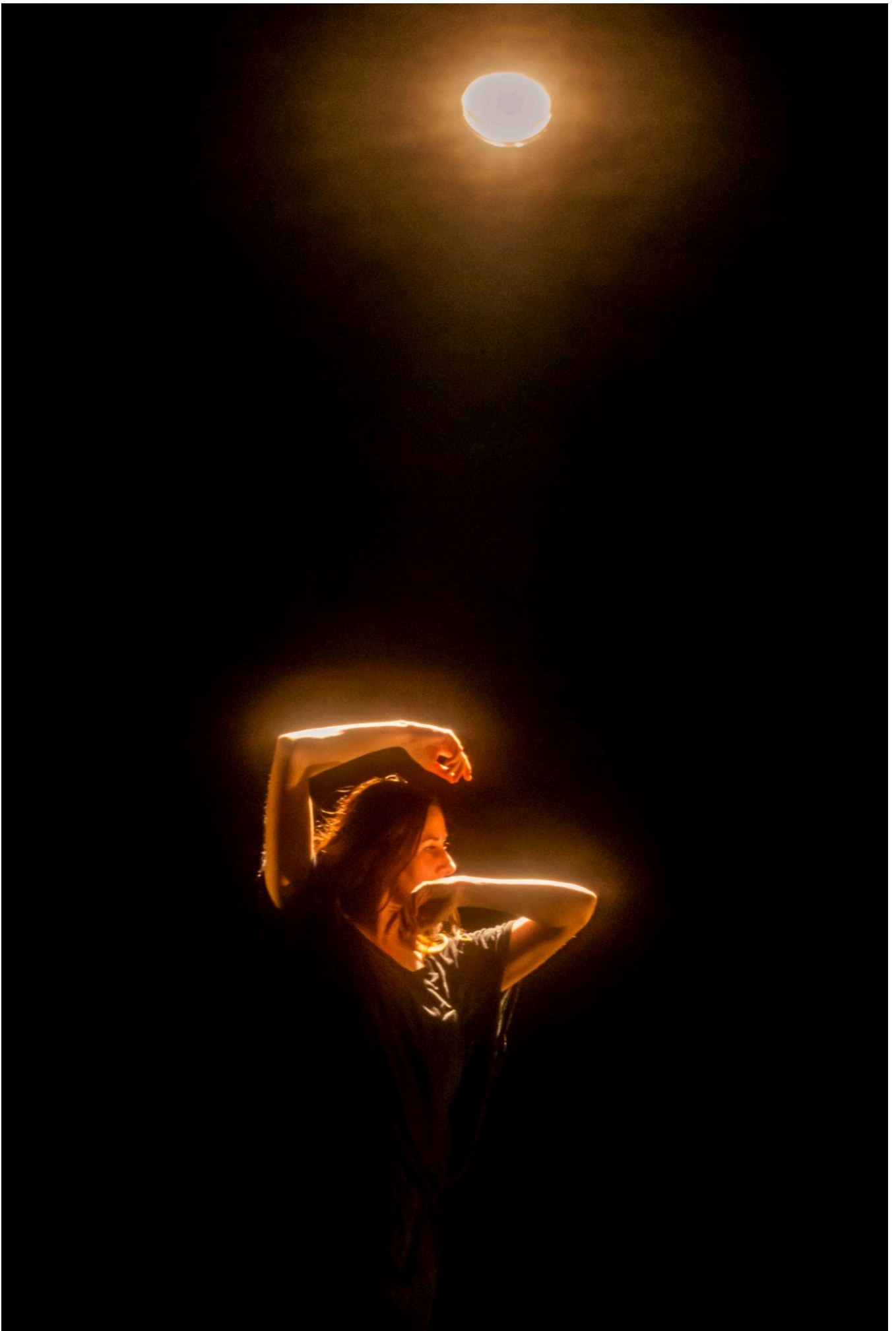
Two Dancer: Dana Fouras