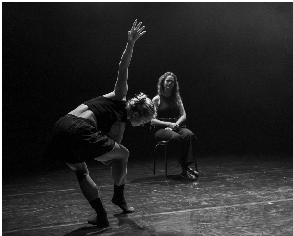
Lien