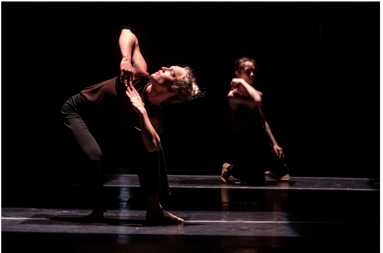
Two x Three