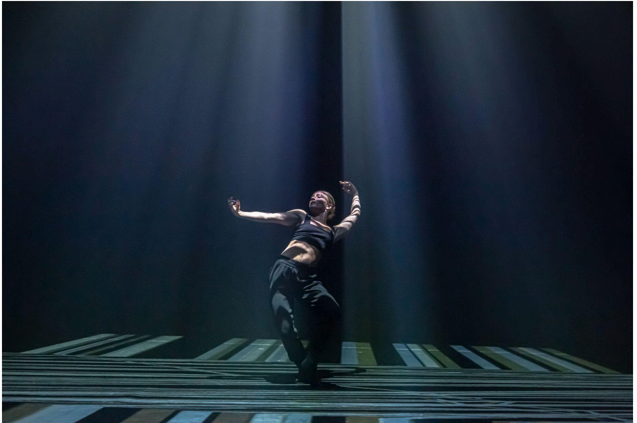
Unfolding