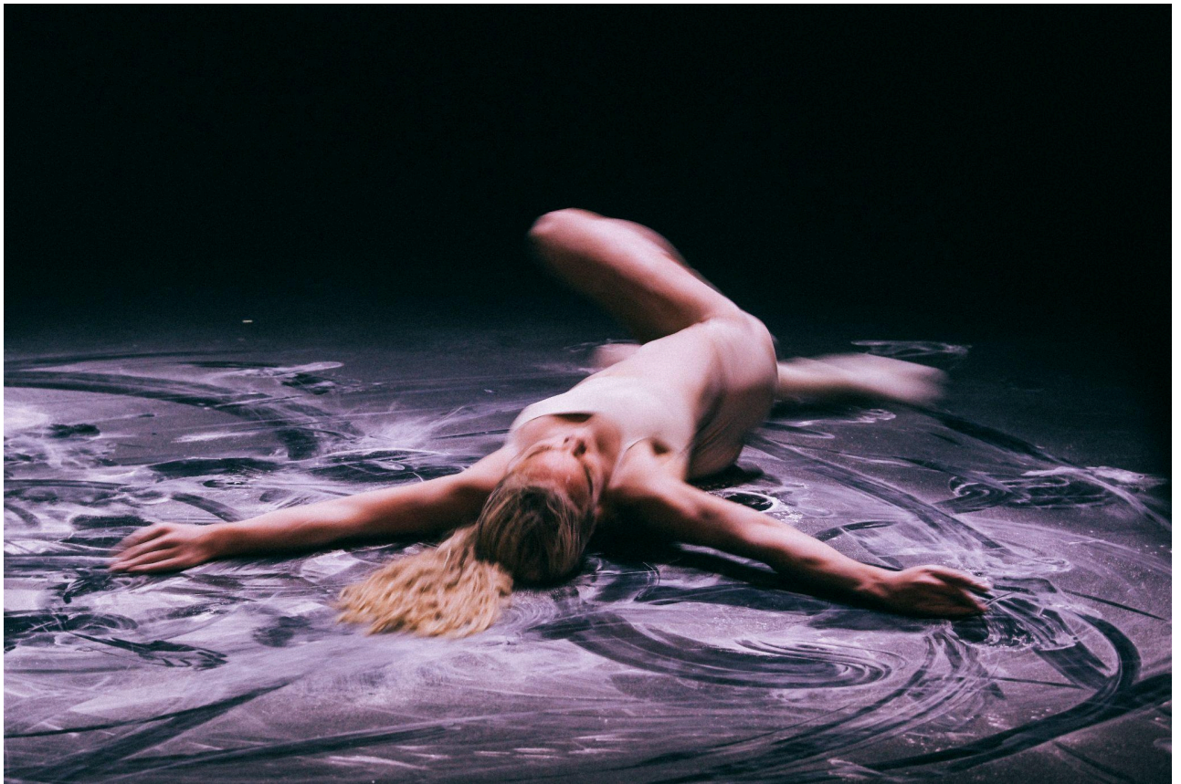
Epilogue